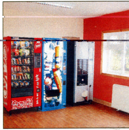
Waiting room and refreshments at NCT centre