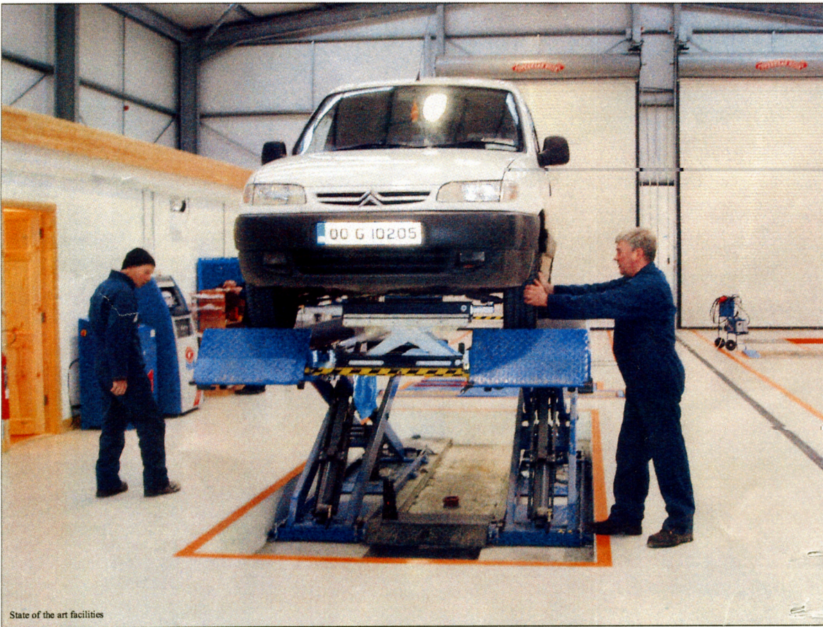
State of the art facilities