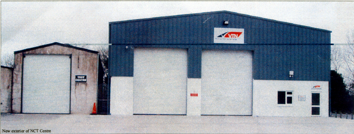
New exterior of NCT Centre